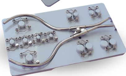
The set of 10

Set of 10 in a sterilising tray and with forceps (beginner's set).