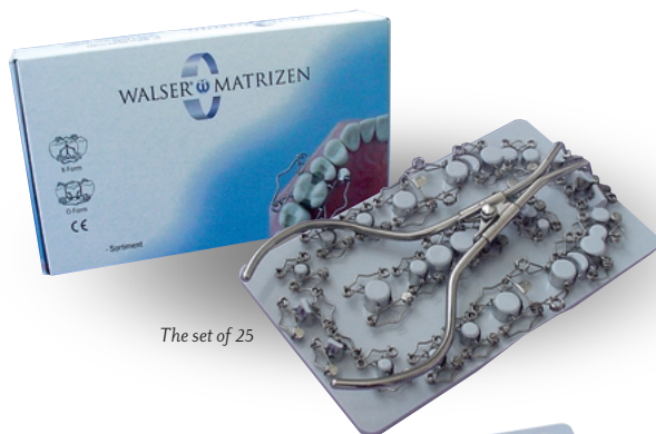
The set of 25