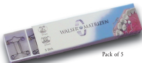
Pack of 5