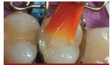
Figure 12 A No. 2 Flat Keystone brush was used to smooth and adapt the composite to the marginal area. This will help to reduce the amount of rotary finishing needed.

cavity form, the operative area was isolated with a rubber dam (Figure 2). Notice the overcontoured proximal restoration in the adjacent tooth. This surface was recontoured and polished before placement of the matrix to create an ideal proximal contact for the restoration that is being placed (Figure 3).