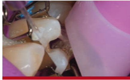
Figure 6 The etchant was rinsed for at least 15 seconds (a longer rinse time can be used). Then, the preparation was air-dried thoroughly, removing all moisture.