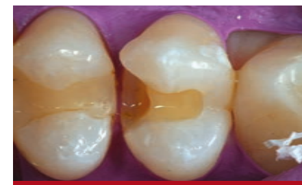
Figure 2 After isolation, the defective restoration was removed, and the preparation was modified to remove the recurrent caries. Note the overcontouring of the composite restoration in tooth No. 4 and how this helped to create a concavity in the distoproximal of the restoration (see Figure 1) that is now to be replaced on tooth No. 5.