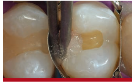
Figure 7 A desensitizer was placed to rewet the enamel and dentin surfaces and gain initial penetration of HEMA and fluoride into the dentinal tubules to aid in formation of the hybrid zone.