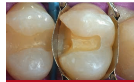
Figure 4 Using placement forceps, the Walser matrix (No. 6 for small bicuspid) was placed around the prepared tooth. If the matrix does not easily slip through the proximal area, lighten the contact with a 30- \mu m diamond strip. A flexible wedge helped seal the gingival floor of the proximal box tightly against the cavosurface margin.