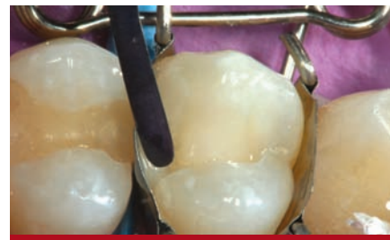
Figure 11 A FlexiThin Mini 4 was used to place the facial increment of composite (Beautiful II) in the preparation.