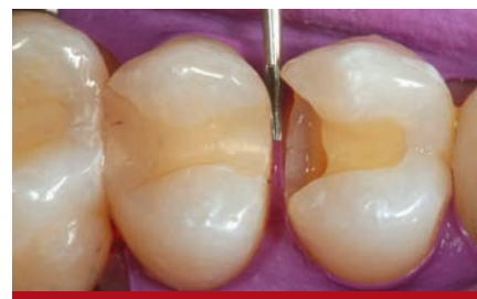
Figure 3 An ET ® 3 (Brasseler USA) was used to contour the adjacent restoration before the placement of the matrix on tooth No. 5.