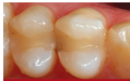
Figure 1 Preoperative occlusal view of tooth No. 5, which had recurrent caries in the lingual-proximal area of a 10-year-old composite resin restoration.

The patient presented with an old Class 2 composite that had decay on the lingual aspect of the proximal portion of the restoration (Figure 1). After removal of the restorative material, associated decay, and preparation of the proximal